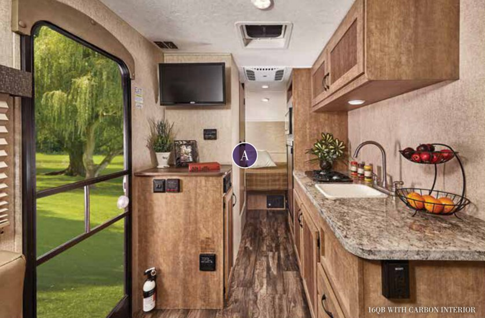
16QB WITH CARBON INTERIOR