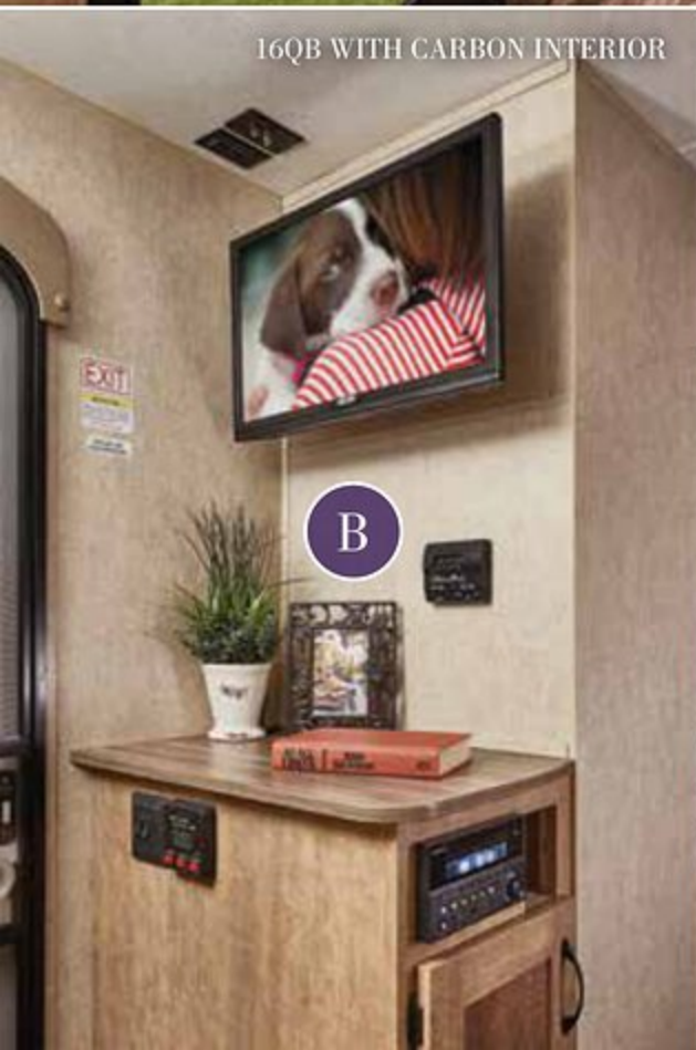
16QB WITH CARBON INTERIOR