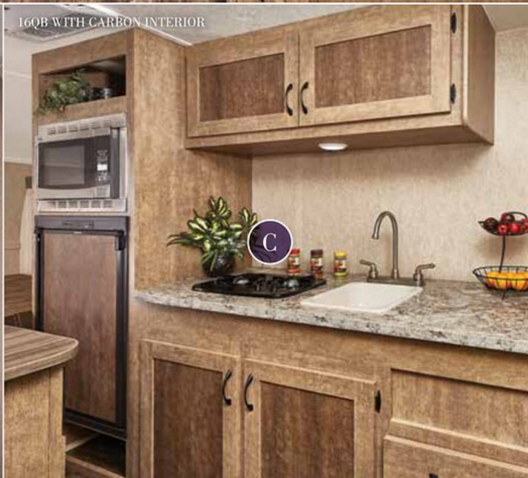
16QB WITH CARBON INTERIOR